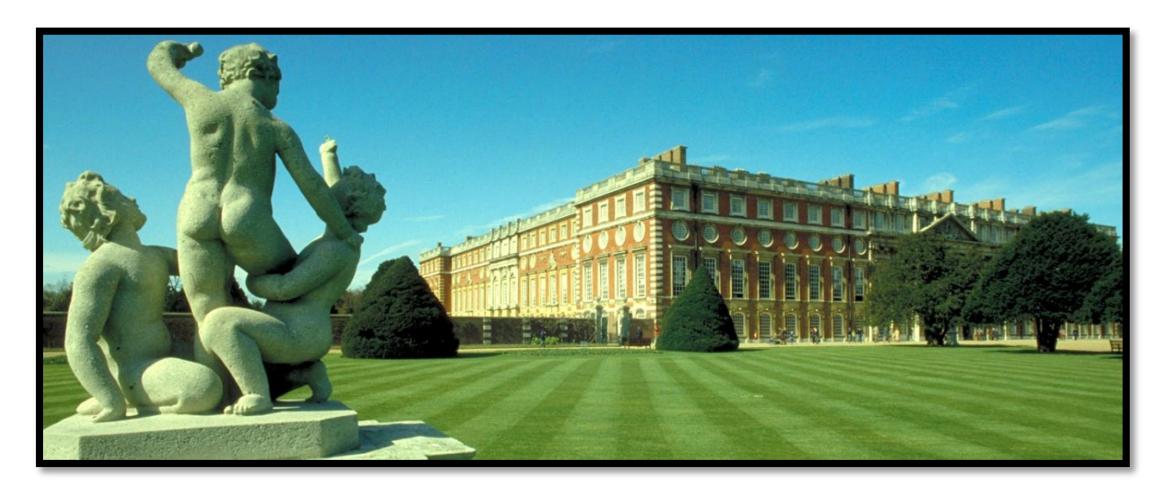
Day 1: Hampton Court Palace

Start your journey at <u>Hampton Court Palace</u>, situated about 40min from London. Explore the Young Henry VIII exhibition, Henry VIII's Kitchens, The Chapel Royal and William III's apartments with an inclusive audio guide or a costumed guided tour for your group. Don't miss the famous Hampton Court Maze, the oldest hedge maze in the world and the amazing Great Vine.